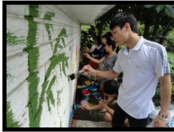
Vietnam CLE Students Painting a Mural at BABSEA CLE House