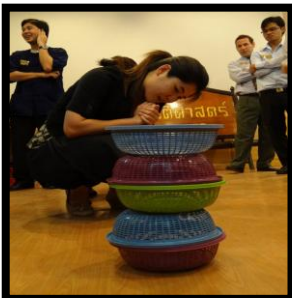
A Thai Law Professor Learns to Teach Interactively

Thankfully, there are ways to address some of these problems and to expand access to justice and protection of basic rights for poor and marginalized communities. BABSEA CLE programs are one such way.