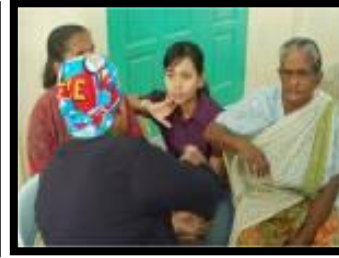
Malay CLE Student on Outreach in a Rural Tamil Community in Malaysia