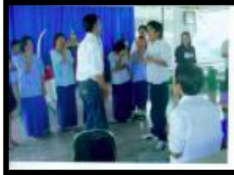
Thailand CLE Students in the Chiang Mai Women's Prison