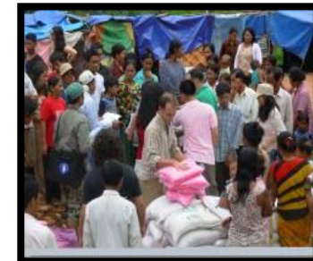
A Canadian Legal Studies Intern Gives Mosquito Nets to an Evicted Cambodian Community

The internship also offers a variety of opportunities in which interns are exposed to social justice issues. Past interns have contributed to legal analysis of draft laws, distributed relief supplies to recently evicted communities, farmed and taught at BABSEA CLE community development sites, in addition to directly participating in university based institutional clinical legal education program-building workshops.