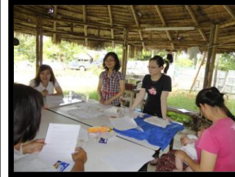
Legal Teaching by Vietnam CLE Students at Wildflower Women's Home