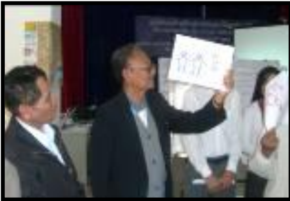
Laos Bar Assoc. Members Learn Interactive Teaching Methods